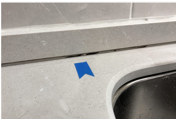
Gap visible behind sink upstand before sealant.