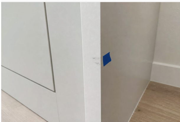
Paint scuff visible on the wardrobe return.