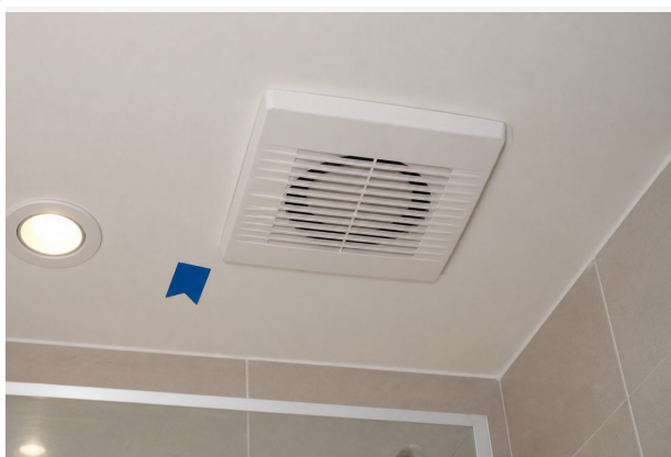
Extractor fan did not operate during the check.

Jul 7, 2026 - bathroom-extractor-fan.jpg